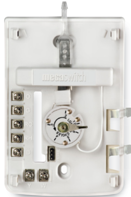
Inside of Model 500 Shown